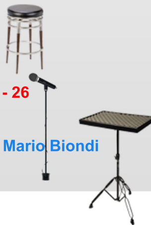
AUX 1-2 IEM Mario Biondi