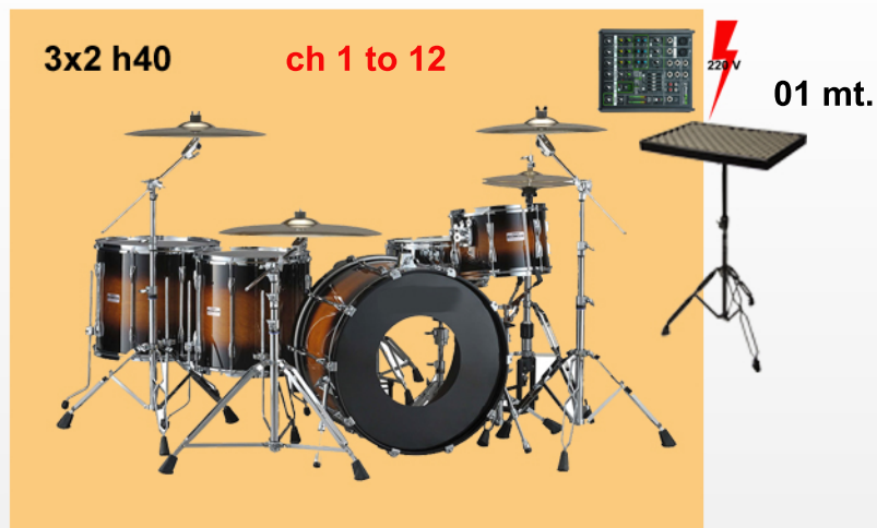
AUX 3-4 (xlr from stage mix)