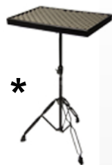
* laptop table

P.S.: marks and images shown are purely demonstrative but represent the correct layout of the backline.